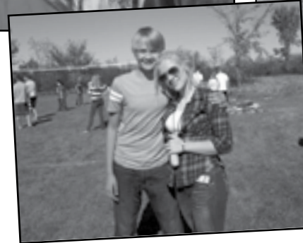
PALC youth and family members traveled north to Esko, MN for the Fall Youth Rally in September.